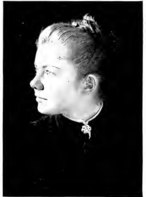
MRS. H. H. A. BEACH.